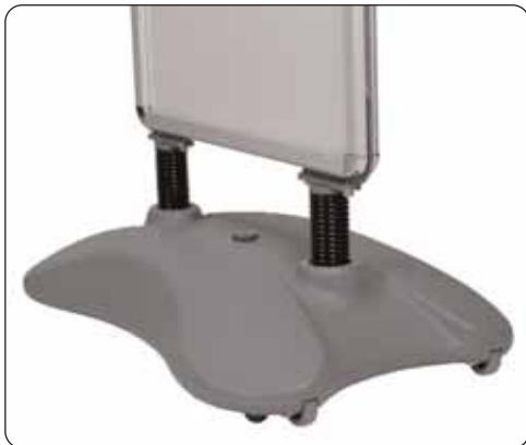
Integral wheels make Whirlwind easy to move