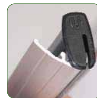
Twista Plus Top Rail