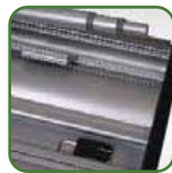
Integral Pole Storage