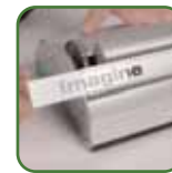
Add your own branding if required

*Graphic tension may be re-applied or added to by turning the ratchet tensioner clockwise; 6 clicks of the ratchet tensioner equal 1 revolution of the banner stand spring. (NB Units are supplied pre-tensioned)