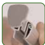
Universal grippa/adhesive Top rail