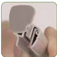
Universal grippa/ self-adhesive top rail